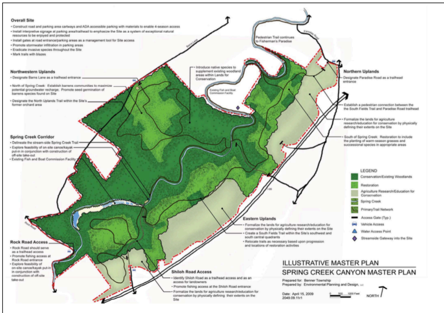
APRIL 15, 2009 SPRING CREEK CANYON CONSERVATION MASTER PLAN